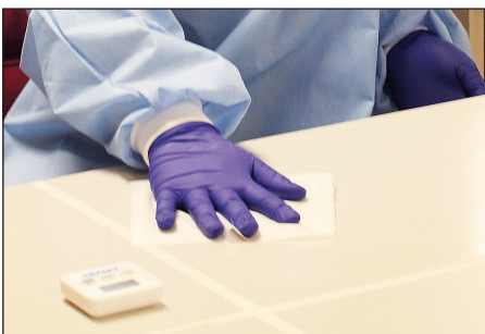
Figure 1: A disinfectant wipe being used on a single quadrant.