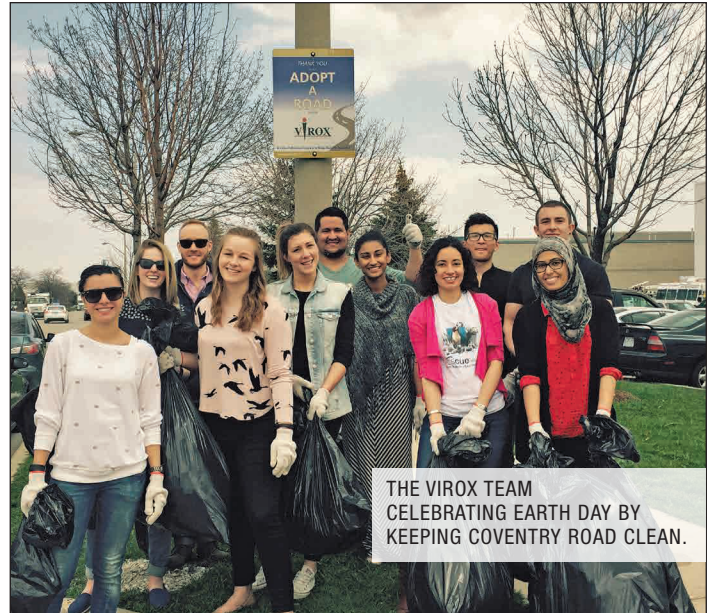
THE VIROX TEAM CELEBRATING EARTH DAY BY KEEPING COVENTRY ROAD CLEAN.

We are pleased to announce the launch of our new PREempt™ family product line which includes both surface and instrument cleaners and disinfectants. This brand will replace the Accel brand in markets such as respiratory therapy, labs, tattoo parlours, spas and salons, footcare, and other markets that have unique processing requirements. This brand will include specific label language and industry specific efficacy claims to help user compliance with cleaning and disinfection protocols. To learn more about PREempt™ please visit http://info.virox.com/preemptproductscan