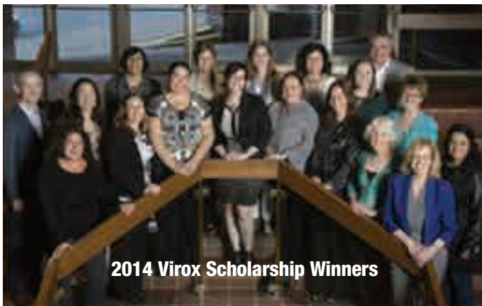
2014 Virox Scholarship Winners