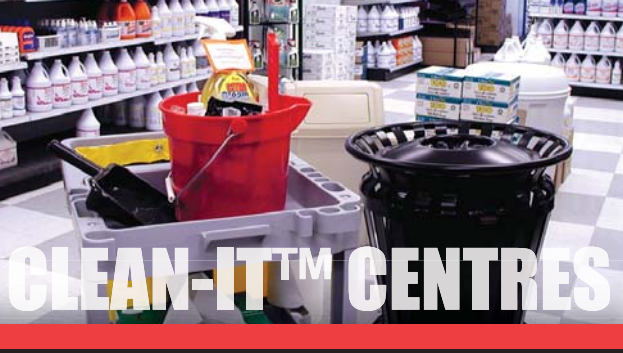
"CONVENIENT PICK UP THAT WORKS FOR YOU."

Some Customers Are Just Luckier Than Others